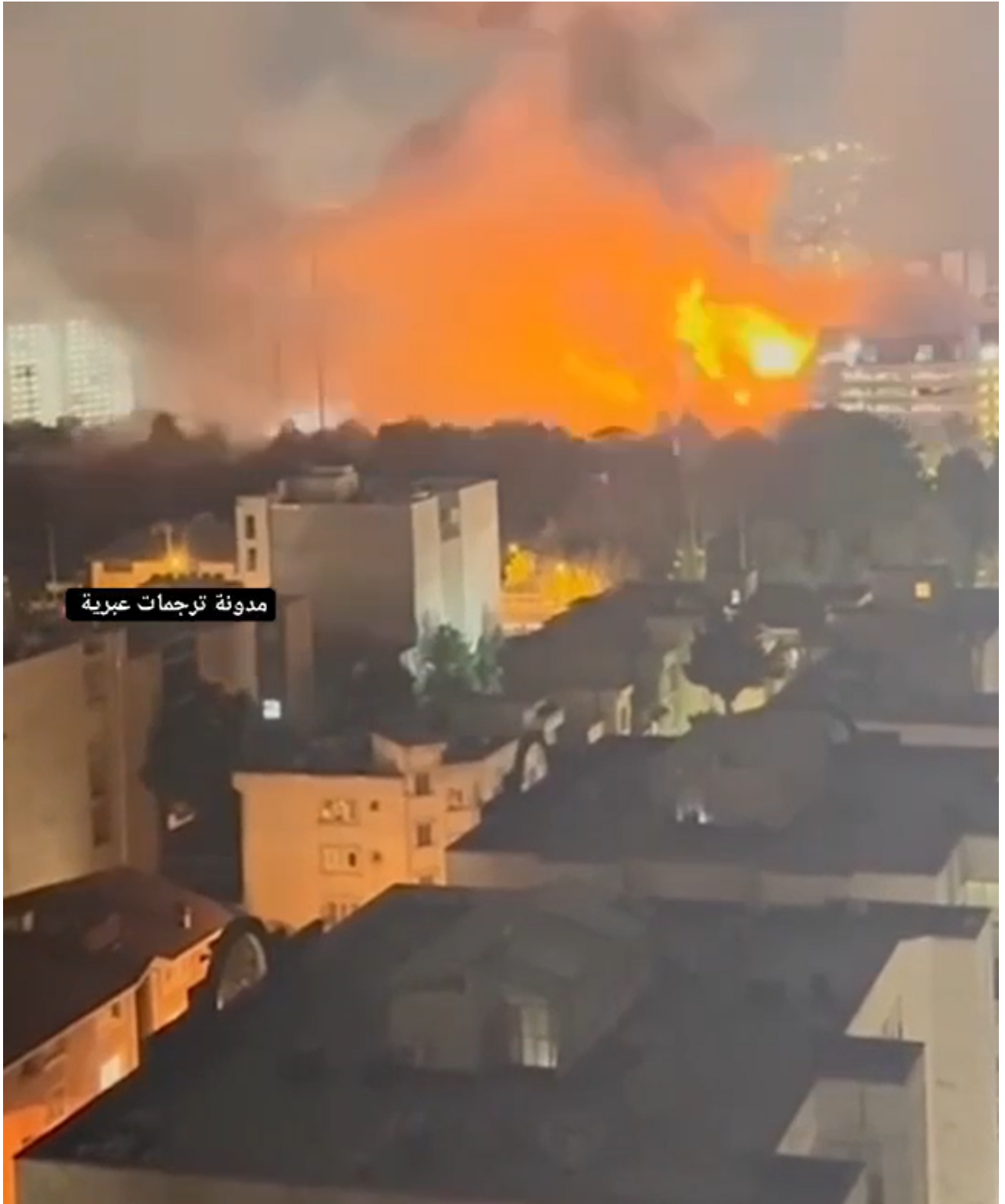
مدونة ترجمات عبرية